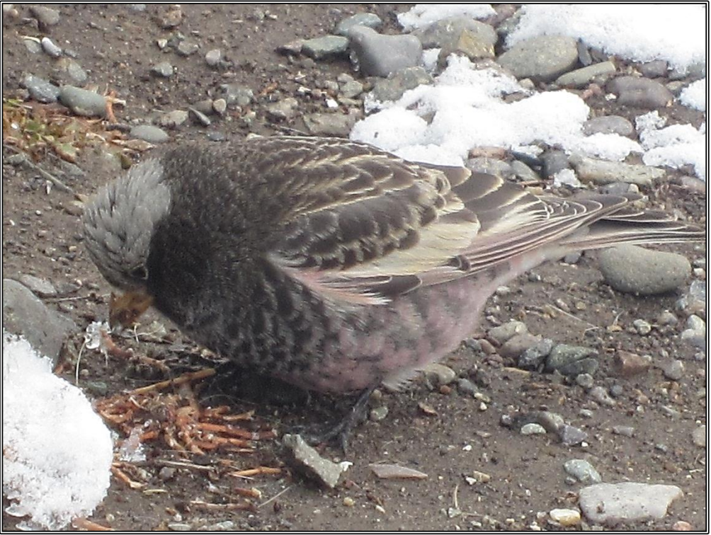
This Black Rosy-Finch was found during a stop at the Cimarron gas station. It was hanging out in a mixed flock with Dark-eyed Juncos and Brown-capped Rosy-Finches.

If you want to see a Rosy-Finch, your best bet is to drive up to the mountains and patrol on foot. Or, better yet, make friends with someone who lives in the mountains and has a feeder. Either way, Rosy-Finches are a real treat, and they are definitely worth going out of your way for.