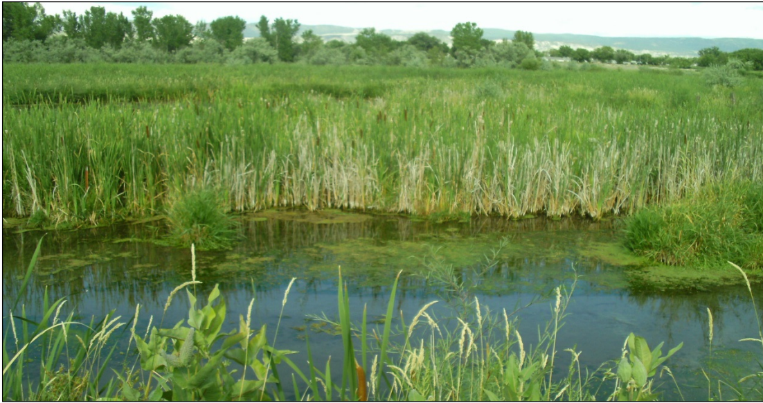
One of several wetland ponds

In the Fall 2014 issue of Canyon Wrenderings , information was provided about BCAS partnering with the City of Montrose to develop a plan for a city property that would be specifically managed for wildlife. Several BCAS members have met to discuss conceptual uses of the property and identified an initial need to collect baseline data in 2015. Baseline data would be collected to identify seasonal changes in vegetation and wildlife species and persistence and volume of water present on the site throughout the year in anticipation of developing a visitor trail and interpretive signs. Recently, representatives of BCAS met with the Montrose Parks Board to discuss concepts being discussed by BCAS members. At this time, we are in the beginning stages of the project, so it is a wonderful time for anyone who would like to get in on the ground floor of planning to help keep the project moving forward. Recently, Claudia Strijek of Gunnison contacted BCAS and expressed an interest in working on the management plan. Claudia has wide experience in environmental sciences and has a strong graphic design background. We will keep you posted on how the project proceeds and hope that you might be interested in participating. (Text is continued on next page.)