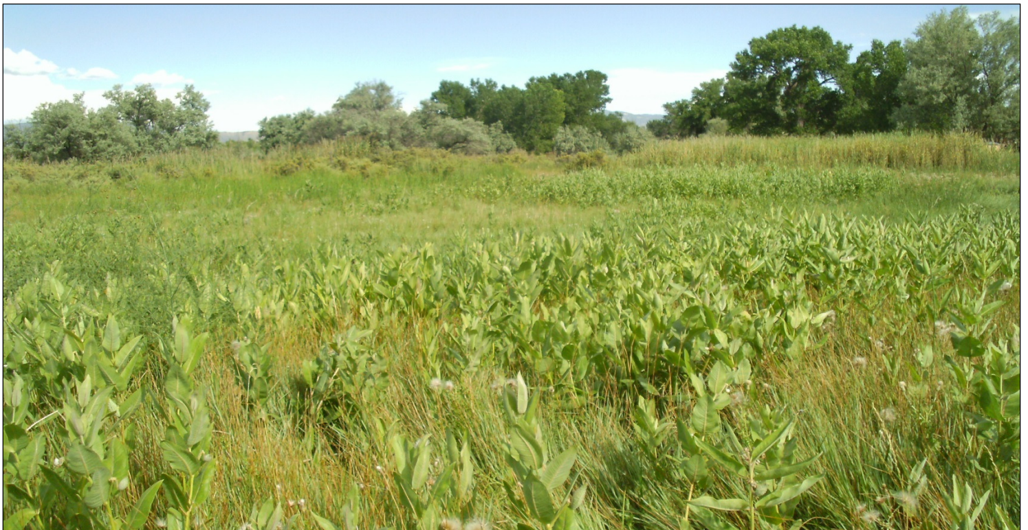
Field with milkweed in upland portion of property. Monarch butterflies depend on milkweed during different life stages.