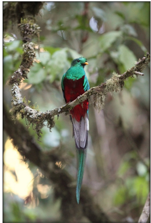
Resplendent quetzal found in Costa Rica

TIP: to put BCAS website on your desktop for quick access, minimize the website then drag the left side of the address bar to your desktop. BCAS is now one click away!