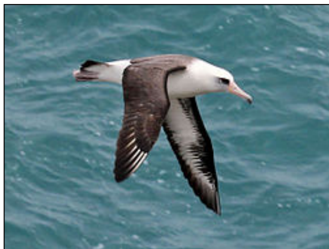
Photo of Laysan Albatross

Captive birds are known to live longer than expected; however, a bird living with the trials presented by predators, natural disasters, loss of habitat etc. generally does not live as long as a bird in captivity. Recently discovered was an actively breeding 63-year-old Laysan Albatross on her nest. Several documented 60 and 62 year old Laysan Albatrosses have also been noted.