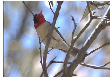
Photo of Red-faced Warbler

Heading south we birded up Sabino Canyon near Tucson then off to Patagonia. Patagonia is known for numerous species of birds that never make it up to Colorado and we saw a bunch of them. Patagonia State Park was one of the many highlights as was the Nature Conservancy site just outside of town. There we were treated with armchair birding, the biggest difficulty being deciding which feeder to watch!