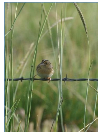
Photo of Grasshopper Sparrow.