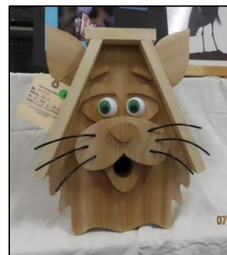
Photos clockwise from left: BCAS Booth at the Montrose County Fair featuring birdhouses donated by Woodworkers Guild members, Gnome House, Dog Character, and Cat Character.