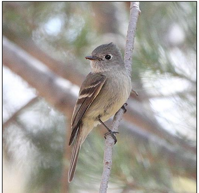
Hammond's Flycatcher: Photo credit Dominic Sherony, CC BY-SA 2.0 < https://creativecommons.org/licenses/by-sa/2.0 >, via Wikimedia Commons

Hammond's Flycatcher ( Empidonax hammondi ) is one of several Empidonax flycatchers that breed in western Colorado. The term "Empidonax" is a Greek word meaning "king of the gnats," and not "all of these birds look alike." Birders frustrated with trying to identify them in the field would testify to this description. Hammond's flycatchers are small, olive-green birds that nest and forage high in mature coniferous forests. The bird has a prominent eye ring and wing bars and a small, dark bill. Hammond's Flycatchers are most easily confused with Dusky Flycatchers, as even their songs are similar.