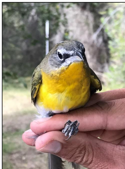
This Yellow-breasted Chat visited the Ridgway State Park migratory bird banding station September 11, 2019.

Black-headed Grosbeak (BHGR) Cassin's Vireo (CAVI) Cedar Waxwing (CEDW) Evening Grosbeak (EVGR) Fox Sparrow (FOSP) Gray Catbird (GRCA) Green-tailed Towhee (GTTO) House Finch (HOFI) House Wren (HOWR) MacGillivray's Warbler (MGWA) Song Sparrow (SOSP) Western Tanager (WETA) Western Wood Peewee (WEWP) Wilson's Warbler (WIWA) Yellow Warbler (YEWA)