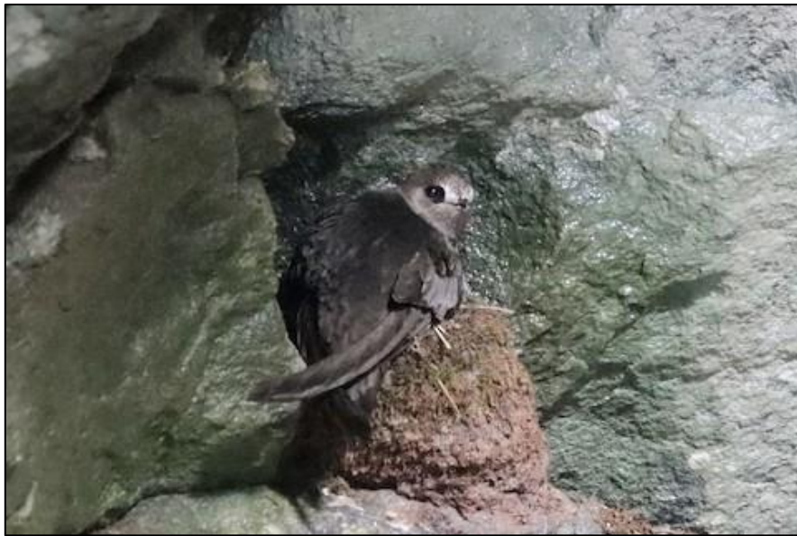
Black Swift on chick. Photo by Verlee Sanburg during BCAS field trip to Box Canyon Falls.