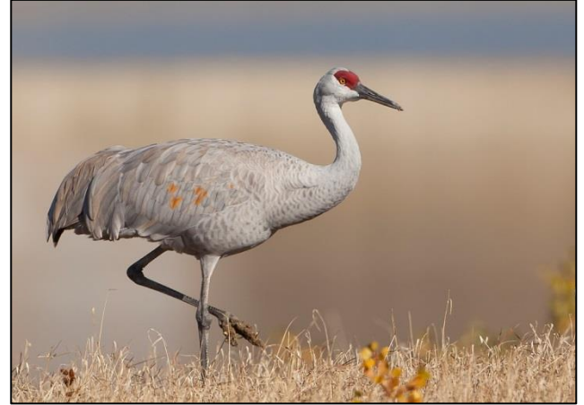
Photo of sandhill crane in the morning.