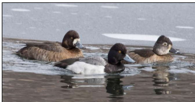
Lesser Scaup with female Ring-necked Duck

3. Crane-watching etiquette also includes attention to your surroundings. North Road, along which we park to view the cranes, is a county road used by local residents to commute from place to place. Park in the parking area or along the shoulder, not on the road. Don't open your car door or step out onto the road without looking. Please be attentive to the traffic while you watch the cranes!