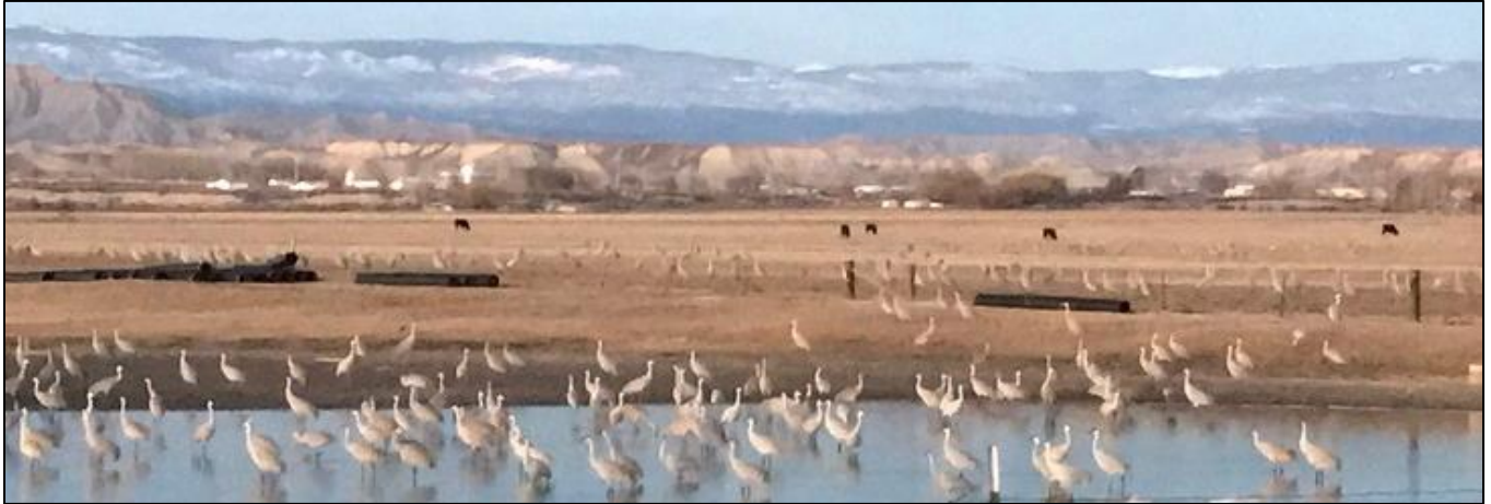
Resident Sandhill Cranes along G50 Road outside of Delta