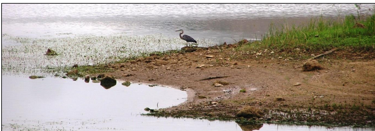
Great Blue Heron taken from the dam area, Fruitgrower's Reservoir